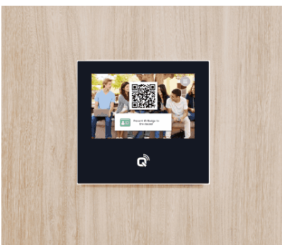
Terminal/Central Managed RFID Solutions