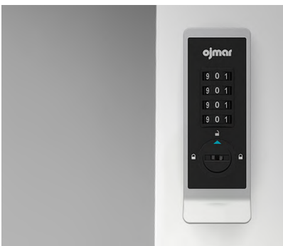
Ojmar Lockr Combi