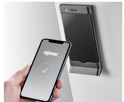
Ojmar OCS Smart