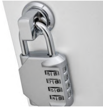
Padlock Cam Lock