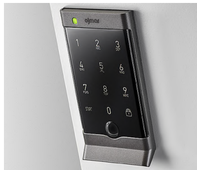
Ojmar OCS Pro