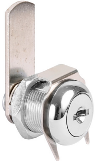
Key Cam Lock