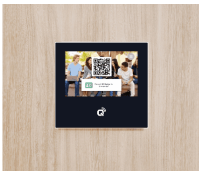
Terminal/Central Managed RFID Solutions