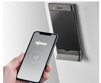
Ojmar OCS Smart