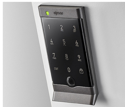
Ojmar OCS Pro