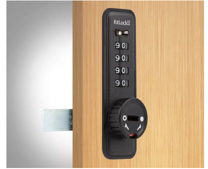
KL15 Kitlock Digi Lock