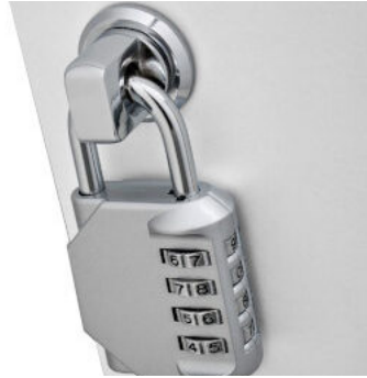
Padlock Cam Lock