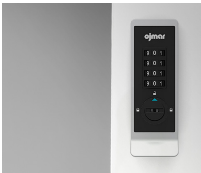
Ojmar Lockr Combi